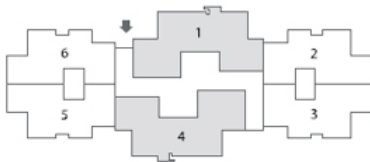
Key Plan - Towers H, J, K, L & M